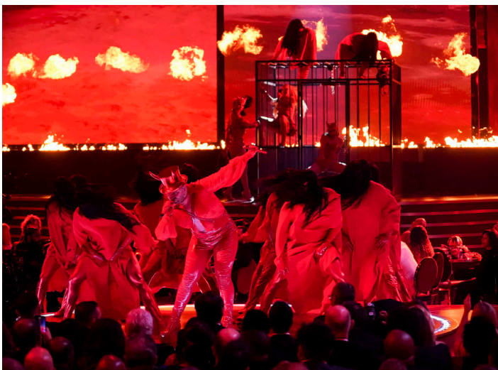
Sam Smith performing at the 2023 Grammy Awards

This is obviously ridiculous and beyond probability as Paul would have never even stepped foot in such an event. But is this any different than Maverick City — who purports to sing for Christ — accepting an award that had just been given to a singer who sings for Satan? Shame on Maverick City. In my humble opinion, this brings into question (at the very least) Maverick City's motivation for singing and (at the very most) the spirit behind Maverick City. Is this really a group that we should be heralding, supporting, paying money to go see, and singing their songs in our churches every Sunday morning?