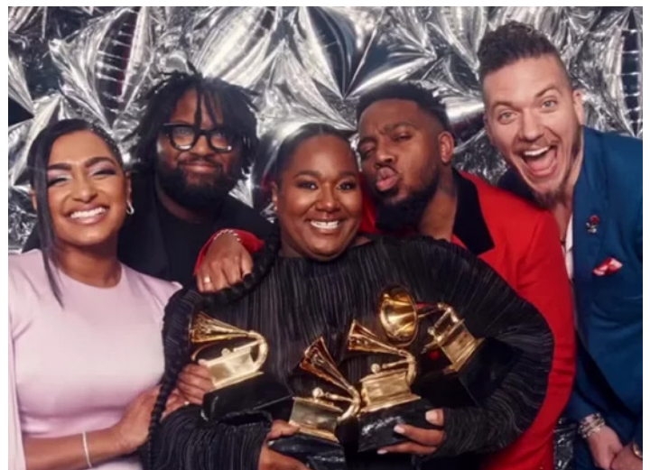
Maverick City receiving multiple awards at the 2023 Grammys