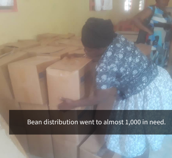
Bean distribution went to almost 1,000 in need.