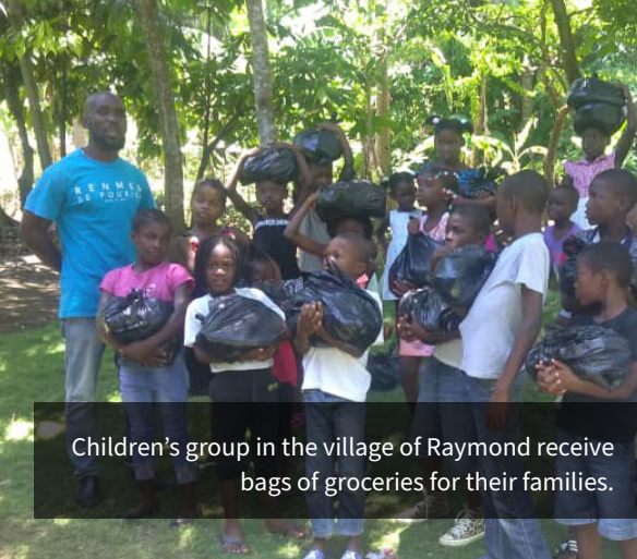
Children's group in the village of Raymond receive bags of groceries for their families.