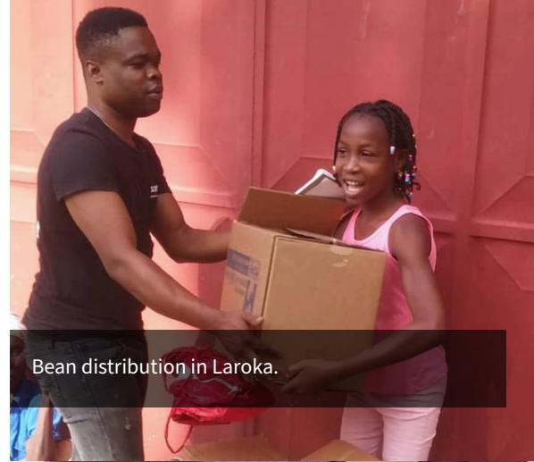
Bean distribution in Laroka.

In short, the Haitian people are suffering unlike any time we have witnessed since we arrived in Haiti. In the last few weeks we have received reports of 6 members of the church becoming newly homeless. The reasoning for this includes: not being able to afford rent because of increased food costs, and being kicked out of their homes as they are told by their family that “the church can help you, we can't afford to feed you anymore.”