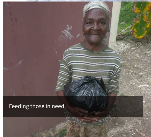
Feeding those in need.