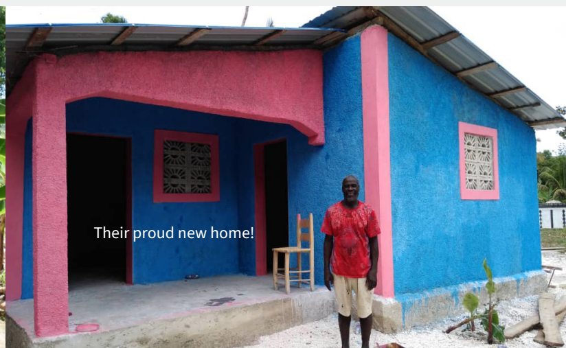
Their proud new home!