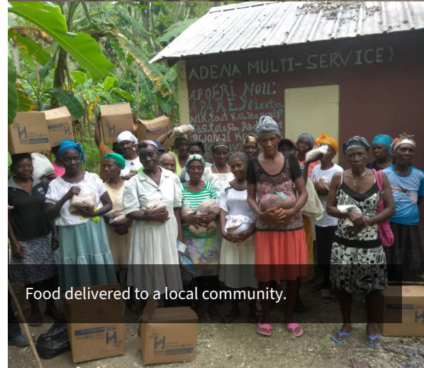
Food delivered to a local community.